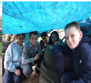
Students work together to build Den - Great Teamwork

Kingswood was a great success everyone had a fantastic time doing lots of activities such as Den building, Climbing, Problem solving and Night-line.