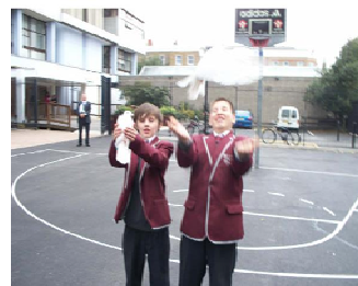
Year 7 students help to release doves in the playground

We then had the Dove launch out in the front of the school, in which 12 white Peace Doves were released. This was a lovely experience for all.