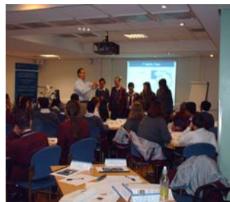
Students present to the rest of the group

Sharpen the saw - renew yourself regularly