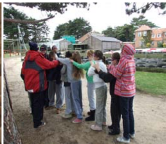
Trust building - students lead each other blind-folded