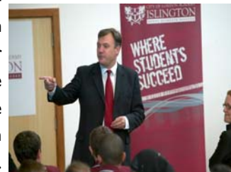
Ed Balls speaks at a Year 7 assembly

building. At the end of the visit Mr Balls commented on how important it is for the Academy to have sponsors such as City University London and the Corporation of London as they will be able to offer our students so much more than previously. Ed Balls ended his visit by saying that he “is confident that the next two, three or five years will see results shooting up”.