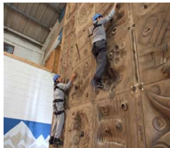
Rock climbing gives students a fantastic sense of achievement