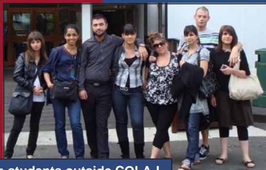
The French students outside COLA-I