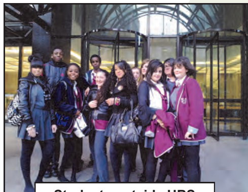
Students outside UBS

In the first session, students interviewed employees from UBS including bankers and IT managers in order to investigate what it’s really like working for a large international firm.